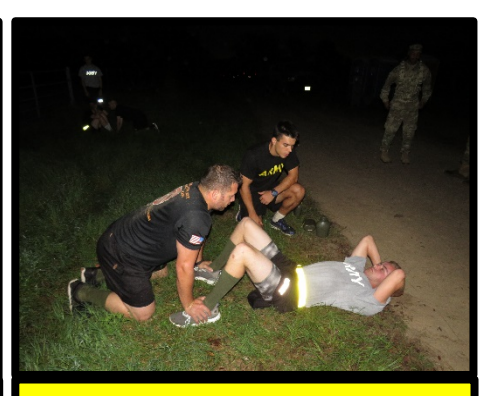
Ranger Challenge conducting a diagnostic PT test at Gibbs Ranch.