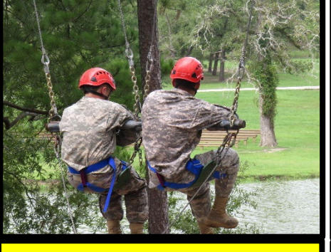
MS1s and MS2s on the swing at the University Camp