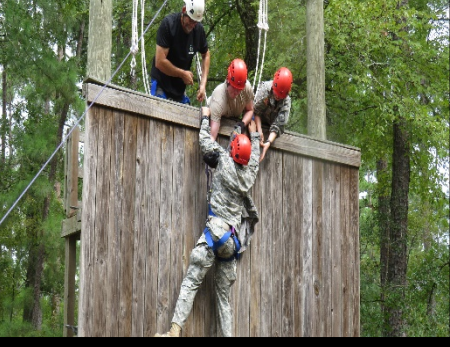
MS1s and MS2s overcoming obstacles at the University Camp.