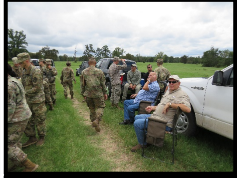
The Military Science Alumni Club (MSAC) after grilling fajitas for the cadets at the end of the Fall FTX.