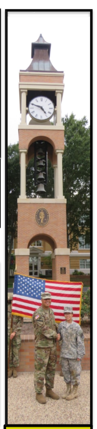
On September 13, 2018, Cadet Nancy Tran (Sophomore) contracted.