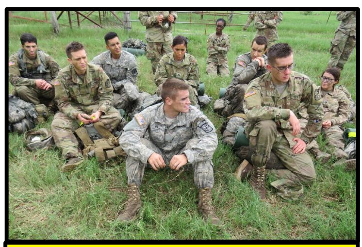
MS3s conducting an "After Action Review" (AAR) at the end of the FTX